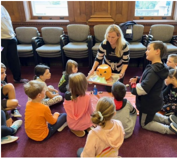
Our Super Science Saturday program gets kids hands-on with science experiments.

We also sent out a general summer programming survey