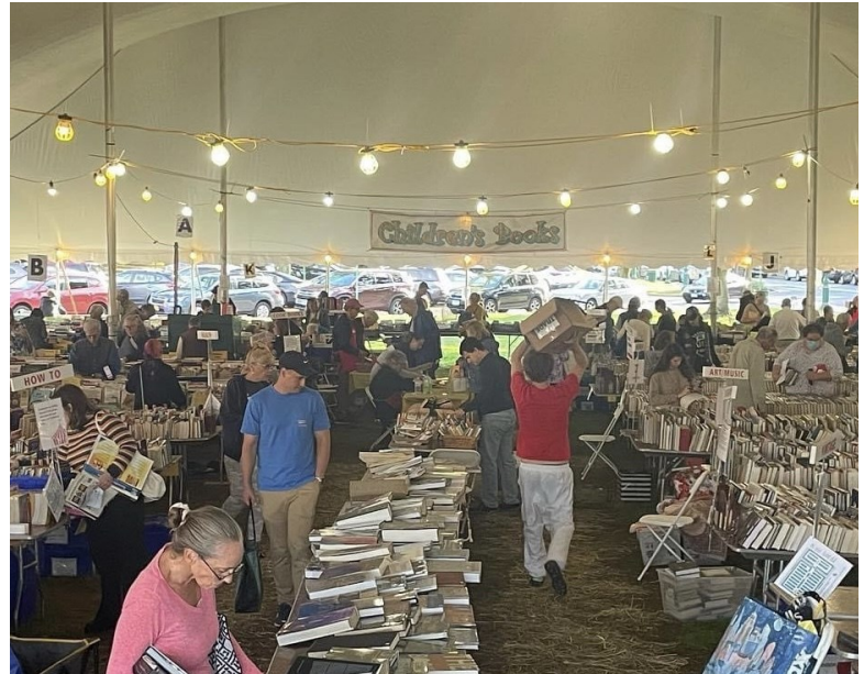
The Friends Annual Book Sale on the Branford green was held September 22-25, and each day was packed with shoppers. The event hit a new record in sales!

The Friends Annual Book Sale on the Green was a huge success, generating over $63,000