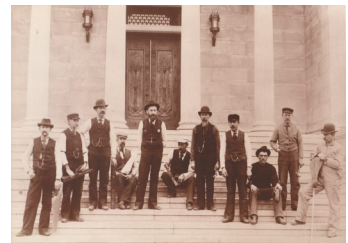
The skilled craftsmen who brought the building plans to life in 1896.