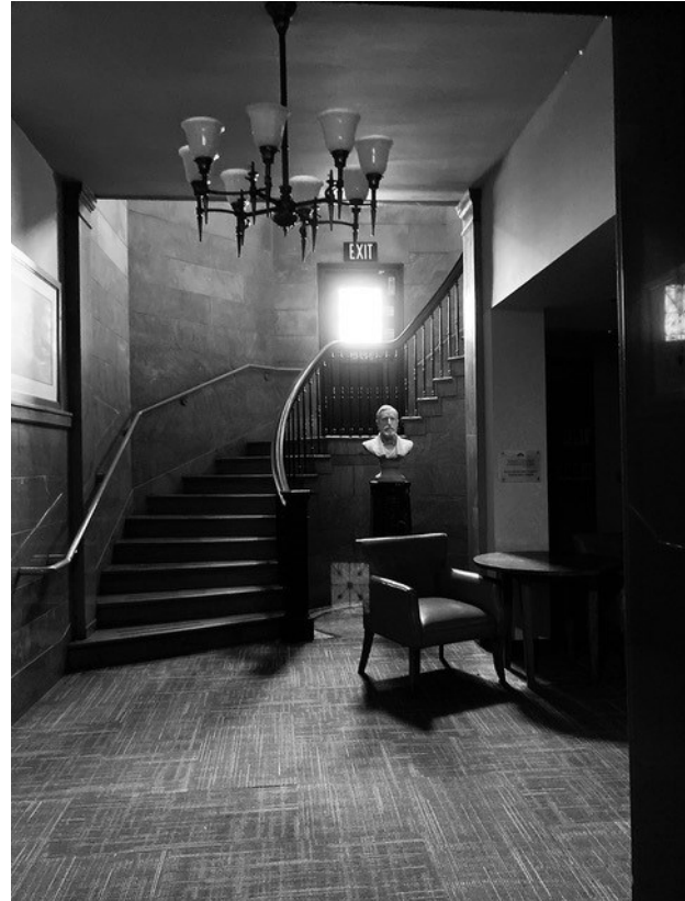
A brief power outage was an opportunity to capture this eerie scene.

The Finance Committee met this month to develop the FY 2023 budget, a process that has gone smoothly this year, thanks to the efforts of a cohesive team, including our