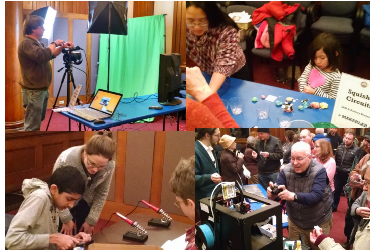
The Grand Opening of the MakerLab brought over 100 people to the library on January 9.

Carly and Katy organized a very successful evening MakerLab Open House on January 9. Volunteers gave demos of the equipment which included the 3D printer, soldering, Arduino, sewing and video production. Over 100 people attended, including librarians from