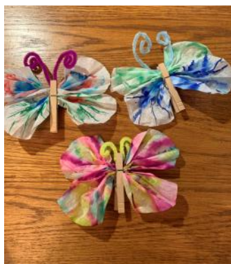
Take and Make butterfly creations.