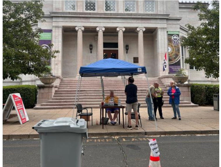
It was a bit rainy during the library's Shred-A-Thon event but that didn't stop people from coming out to shred their documents and support the library.