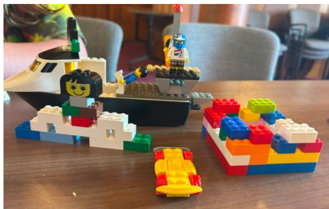
Lego creations by attendees to the Lego Club.

The learning continued in Cool-oology's Science Saturday program, Defying Gravity: Wicked