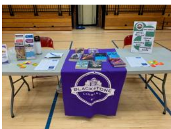
Ready to engage with students at Branford High School Health Fair.