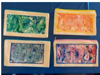
Marbled bags created by teens.