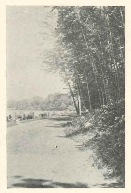
LAKE IN YOUNG'S PARK.

Stony Creek, for instance, they are breeding continually in the meadows, and for this reason the pest cannot be gotten rid of. The Pine Orchard associa-