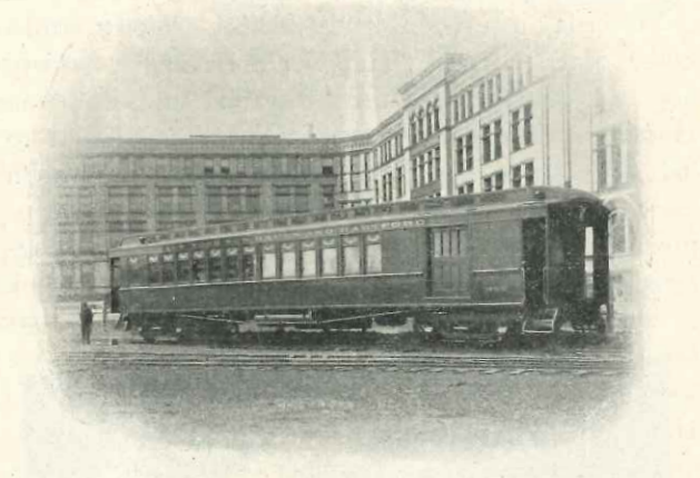
ONE OF THE NEW CARS.

In these days of luxury and comfort in traveling, the New York, New Haven and Hartford road is not unmindful of the demands of the public, and has put upon the road two splendid private