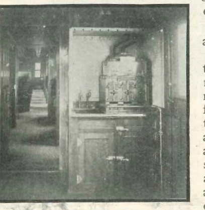
KITCHEN FACILITIES IN CAR

ample facilities afforded in cars to serve light refreshments, or food for invalids. Although there is a gas heater and broiler, sink with hot and cold water and such means of preparing a meal, silver-