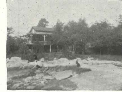
COTTAGE AT PINE ORCHARD.

one of the prettiest that can be imagined, leading out from a