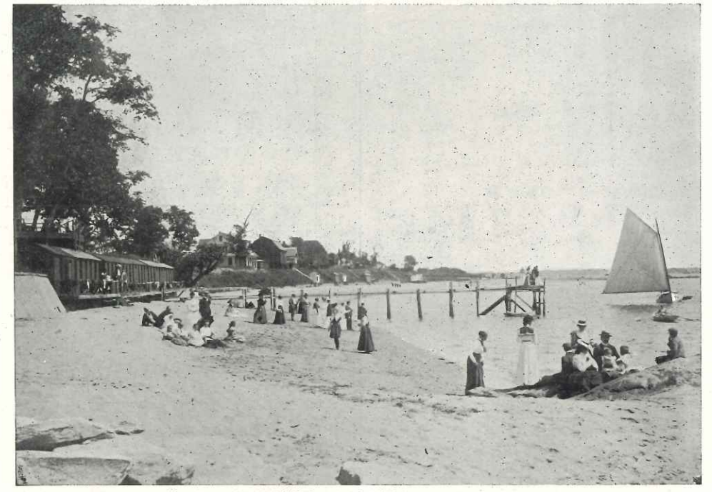
BEACH OPPOSITE MONTOWESE HOUSE.

The popularity of the Montowese is due, aside from its ideal location, to the very capable manage-ment under which the house has been conducted for