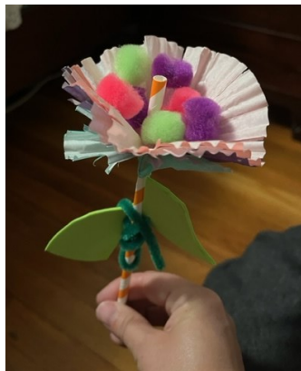
A crafty Take-n-Make flower.