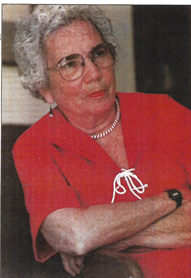
Steffen E. Cretella/The Sound