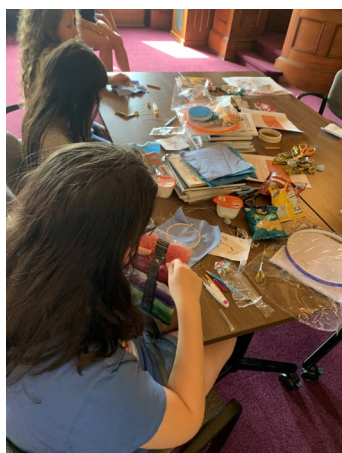
Teens working on embroidery projects.