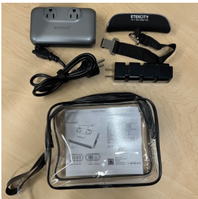
The Travel Kit from the Library of Things includes luggage scale & voltage converter.