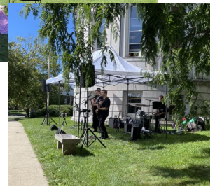
People of all ages came out to enjoy music and games on the library's lawn for Lawn-A-Palooza on Saturday, August 19. Thank you to the David J. Hughes Memorial Fund for making the concert possible.