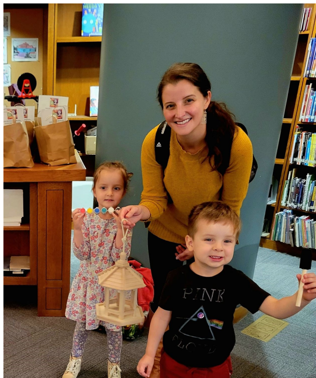
September's Take & Make Kits gave families the opportunity to decorate birdfeeders and learn all about local birds who might benefit from a backyard treat. Thanks to the Allan Louis Loeb Foundation for sponsoring our fall series of nature-themed crafts.

Our first session focused on aerodynamics. During this workshop, participants learned about the history of flight and how liftoff happens. They were then asked to create a series of aircrafts and then test which worked the best. Participants had a blast during these comparisons and could not wait to show them off! The October session is already full.