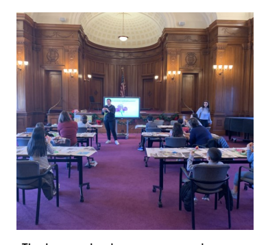
The homeschool meetup group learning about plant biology.