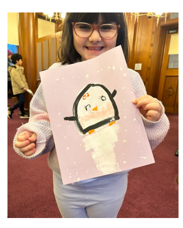
Children loved painting penguins!