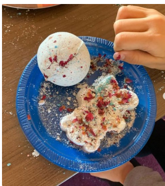
A DIY bath bomb made during a teen program.

We also had several events that allowed children and teens to explore their creativity! Teens celebrated National Poetry Month with a poetry writing workshop. We learned about some of the literary elements common in poetry, read some poems for inspiration, and then tried our hand at writing a few poems of our own! We learned all about ekphrasis — poetry inspired by a work of art — and wrote poems using paintings as our inspiration. Teens also got crafty this month with a DIY bath bomb program. Using a few simple kitchen ingredients, essential oils, and dried flowers, teens made beautiful creations that dissolve in warm water to transform a bath into a sensory experience.