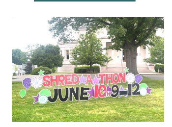
Sign promoting the Shred-A-Thon