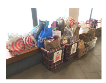
Food donations for the Branford Food Pantry