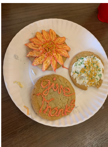
Cookies decorated by teens. Yum!