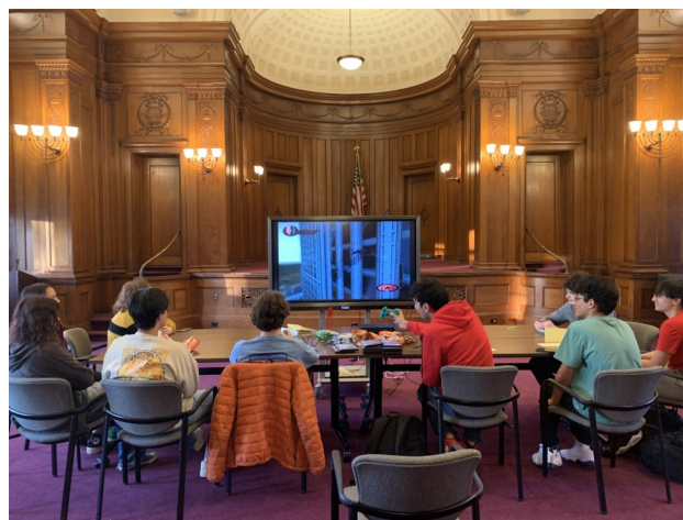
Teen Advisory Group members playtesting donated video games.

The learning continued at our Homeschool meetup this month, where the theme was coding. Homeschool students learned about how algorithms work using a picture book called How to Code a Sandcastle . We then practiced our coding skills by breaking into teams to organize the steps needed to design a paper airplane. We tested our algorithms by swapping our instructions with the other team to see if they could successfully make a paper airplane using our