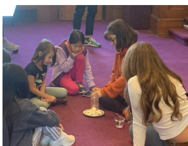
Science Saturday attendees explored the science of magic.