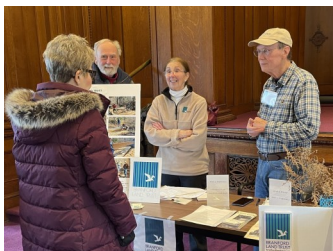
The Community Volunteer Fair hosted 19 organizations and was attended by hundreds of interested community members.