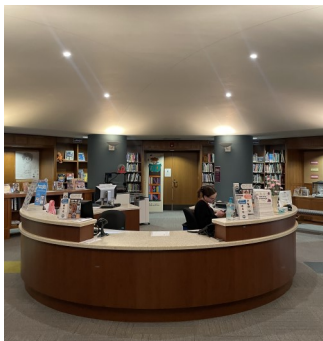
New lighting installed in the Youth Services department brighten the space without overwhelming it.