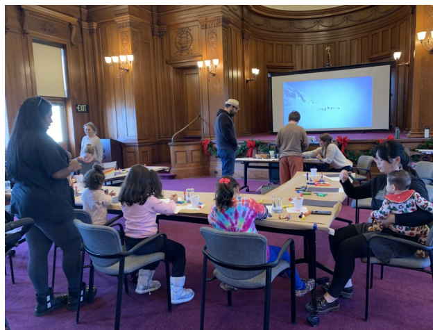
Families participate in a Hot Cocoa Crafternoon.