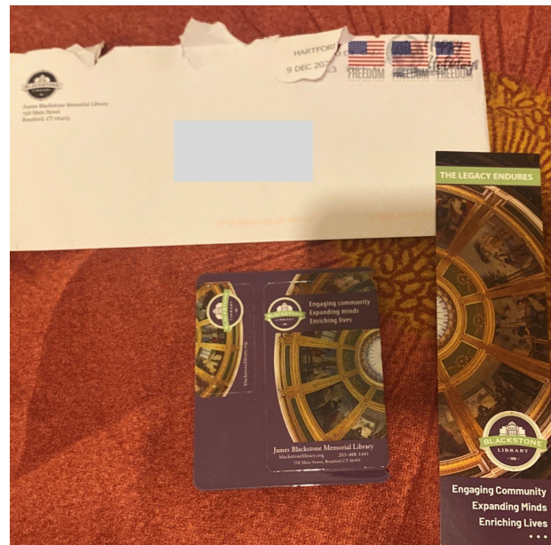
A photo confirming that our library card was received in Sweden. The card was sent in response to a request from a young man collecting cards from around the world for his very sick sister.