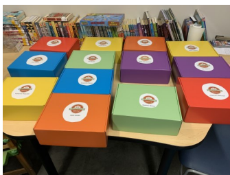
Teen book boxes, ready for pickup!