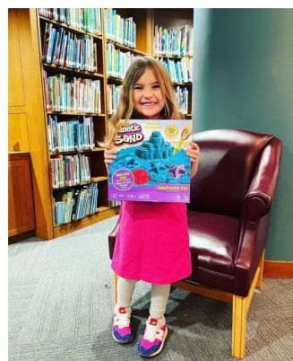
One of five prize-drawing winners.