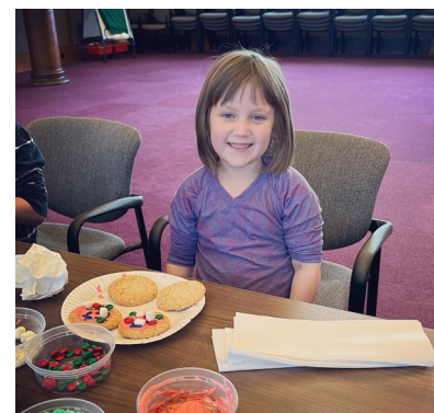
Cookie-decorating programs are always a hit.

Every year it is a huge hit with the littles. They chase the balloons throughout the room and it is a nice way for families to celebrate. Also, the addition of two middle school volunteers was a great way for them to get a taste of what goes on during large scale events. Both volunteers came early to set up the space and discuss their to-do list. They were in charge of welcoming families, counting the number of participants, and handing out our giveaways before the balloon drop. We even convinced them to participate in our hand rhymes and movement activities! They really enjoyed the morning and said they want to help