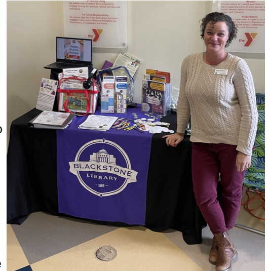
Blackstone's table at the Shoreline Chamber Wellness Fair.