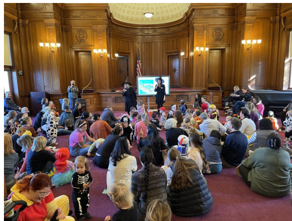
Storytime at the annual Halloween parade.

October wouldn't be complete in Youth Services without a few special events celebrating Halloween! Teens enjoyed a Halloween makeup workshop