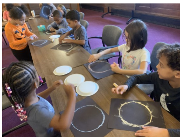
Science Saturday attendees learned about the sun and moon.