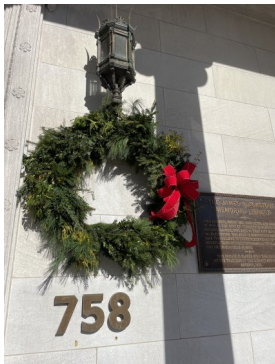
Thanks to the Branford Garden Club for helping the library get into the festive spirit of the season!