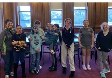
Teen attendees got hands-on learning at the Halloween makeup workshop.