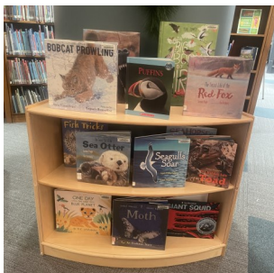
Thanks to a gift from the Friends, the Youth Services department has 4 new display units, at just the right height for young children!