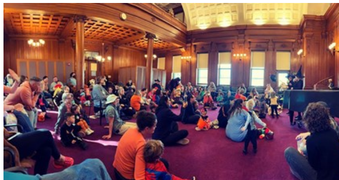
Our annual Halloween Storytime & Parade was back this year, and the auditorium was once again filled with families and children in costume.

This October we participated in a few community-wide events thanks to the Friends of the Blackstone Library. Staff members were able to represent the library at Branford Public Schools' Trunk or Treat, as well as the townwide event held around the Green. We connected with hundreds of families at both events and it was so fun seeing everyone out having fun together.