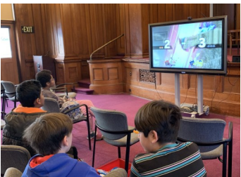
Teens competing in a Nintendo Switch tournament.