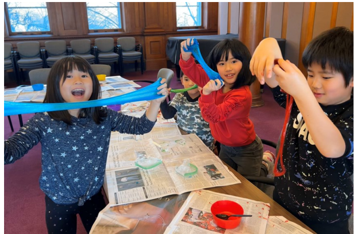
Children's enjoying some Valentine's Day slime!