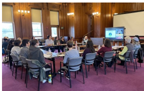
(below) Learning about Emotional Intelligence at our inservice day.