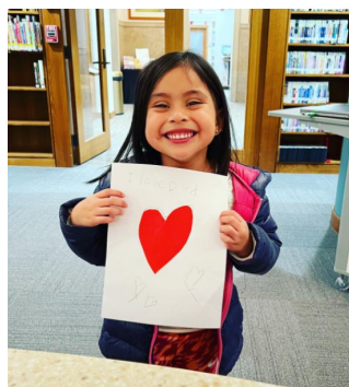
A happy patron after visiting our Valentine's Day card-making station.