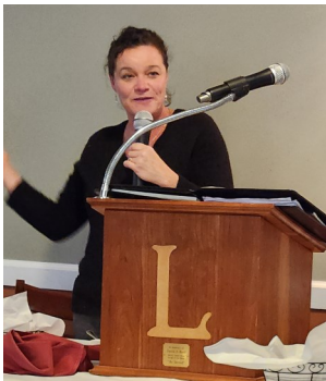
Speaking at the Branford Lions Club meeting in March.

The Branford Lions Club invited me to speak at the March meeting, so I attended and talked about the history of the library and my vision for its future. The Lions Club will be making a gift to the Blackstone to fund the purchase of books about various aspects of Black history.