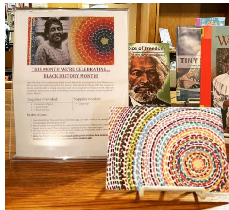
February's Take & Make Program celebrated Alma Thomas, an African-American artist known for her bold and beautiful abstract paintings.