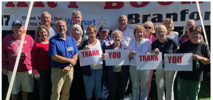
Pictured are some of our volunteers who work year round to bring the Fall Book Sale fundraiser to the Branford Town Green.